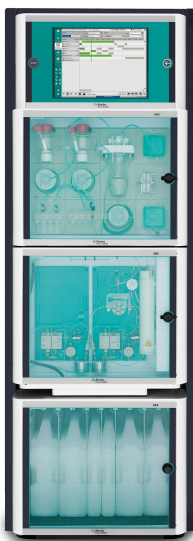
Figure 2. The Metrohm Process Analytics 2060 IC Process Analyzer, along with integrated liquid handling modules and several automated sample preparation options.

The 2060 IC Process Analyzer can run for extended periods in less-frequented areas as there is adequate space reserved for reagents, containers of ultrapure water and/or prepared eluent, and level sensors to alert users when liquid levels are low. By