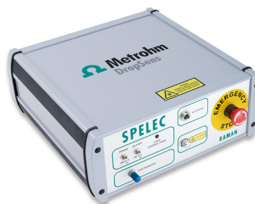
Figure 2. The SPELEC-RAMAN used for the measurements in the application note.

the Raman measurements of the electrode surface at optimal focal distance. Integration time was 20 s.