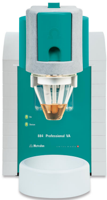
Figure 1. 884 Professional VA manual for MME.

Add 10 mL oxidized sodium chloride brine sample and 2 mL of ultrapure water into the measuring vessel. The determination of iodide is carried out with the 884 Professional VA (Figure 1) using the parameters specified in Table 1. The concentration is determined by two additions of iodate standard addition solution.