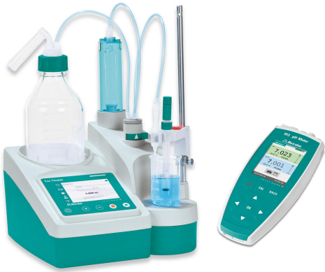
Figure 1. Eco Titrator and a 913 pH Meter with a maintenance-free Ecotrode Gel with NTC.

Well-defined pH values and titration curves are obtained for the tested samples. The results are summarized in Table 1 and Table