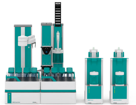
Figure 1. Fully automated OMNIS system for the determination of acid value in edible oils.

To a reasonable amount of sample, a solvent mixture consisting of ethanol and diethyl ether is automatically added, and the solution is stirred for one minute to dissolve the sample. Afterwards, the sample is titrated with standardized ethanolic KOH until after the equivalence point.