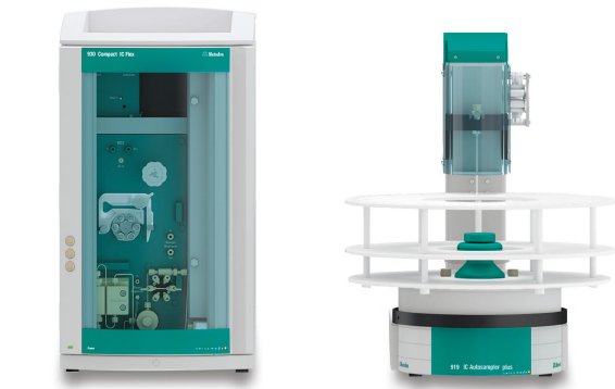
Figure 1. Instrumental setup including a 930 Compact IC Flex with IC Conductivity Detector and a 919 IC Autosampler plus.

The samples were injected directly into the ion chromatograph (Figure 1) without further sample preparation and analyzed using the method parameters given in the USP monograph (Table 1). Anionic components were separated isocratically on a Metrosep A Supp 1 - 250/4.0 column containing the alternative packing material L46. The conductivity signal was detected after sequential suppression.