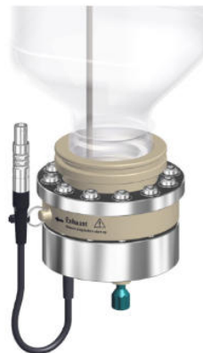
Figure 2. The 948 Continuous IC Module, CEP automatically produces KOH eluent from ultrapure water and a KOH concentrate. The electrochemical eluent production takes place at a membrane in the eluent producer cartridge.

The 948 Continuous IC Module, CEP precisely produces a potassium hydroxide eluent in concentrations from 15100 mmol/L potassium hydroxide (KOH) ( Figure 2 ). The IC was operated with the software MagIC Net, and the MS by MassHunter software. Synchronization of both instruments was controlled via a remote cable. Table 1 lists the most important instrument settings.