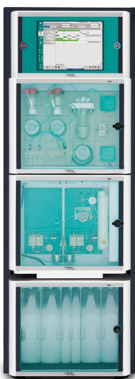
Figure 2. The Metrohm Process Analytics 2060 IC Process Analyzer, along with integrated liquid handling modules and several automated sample preparation options.

The 2060 IC Process Analyzer can run for extended periods in less-frequented areas as there is adequate space reserved for reagents, containers of ultrapure water and/or prepared eluent, and level sensors to alert users when liquid levels are low. By choosing a built-in