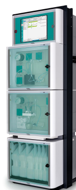
Figure 2. 2060 Process Analyzer for photometric measurements of ultratrace iron and copper in the water-steam circuit of power plants.

The continuous online ultratrace analysis of Fe and Cu in the water-steam circuit of power plants is possible using the 2060 Process Analyzer (Figure 2) from Metrohm Process Analytics. This automated process analysis system enables early detection of corrosion processes and peaks, and also monitors the formation and destruction of the protective oxide layer (Figure 3). Continuous analyses also signal a problem before dissolved metals can reach the condensate stream and thus the turbine blades where they would cause damage. In combination with the power plant's Distributed Control System (DCS), online monitoring of Fe and Cu ensures that corrosion can be controlled before it affects the power plant efficiency, ultimately decreasing downtime and lowering maintenance costs.