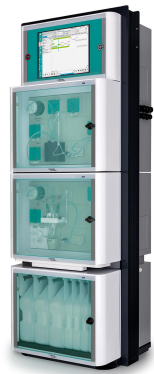
Figure 2. The 2060 TI Process Analyzer is suitable to monitor several critical parameters in nuclear pressurized water reactors.

Other process applications related to the water circuits of energy producers include silica, sodium, nickel, zinc, calcium, magnesium, and chloride. Reliable measurements of these critical parameters are possible with the 2060 TI Process Analyzer from Metrohm Process Analytics ( Figure 2 ).