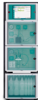
Figure 2. 2060 Process Analyzer for online analysis of ammonia and hydrogen sulfide in the sour water stripping process.

The 2060 Process Analyzer can analyze \text{H}_2\text{S} and \text{NH}_3 simultaneously with automatic cleaning and calibration steps using absolute wet chemical techniques. Sulfide ( \text{S}^{2-} ) is determined by a precipitation titration with silver nitrate ( \text{AgNO}_3 ). Ammonia is determined by Dynamic Standard Addition (DSA). Fast and accurate results are continuously transmitted to the programmable logic controller (PLC) for process control.