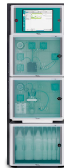
Figure 2. 2060 Process Analyzer for online analysis of ammonia and hydrogen sulfide in the sour water stripping process.

The 2060 Process Analyzer can analyze H 2 S and NH 3 simultaneously with automatic cleaning and calibration steps using absolute wet chemical techniques. Sulfide (S 2- ) is determined by a precipitation titration with silver nitrate (AgNO 3 ). Ammonia is determined by Dynamic Standard Addition (DSA). Fast and accurate results are continuously transmitted to the programmable logic controller (PLC) for process control.