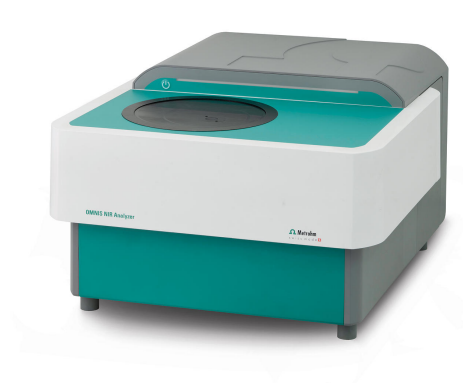
Figure 1. The OMNIS NIR Analyzer Solid from Metrohm.

In this study, samples of lactose with varying water content were analyzed to create a NIRS prediction model for quantification. Lactose monohydrate samples either spiked with water or dried in an oven were measured on an OMNIS NIR Analyzer (Figure 1) in reflection mode (1000–2250 nm) in 19 mm vials using a flexible holder. Single measurement was selected as the measuring mode. Data acquisition and prediction model development were performed with OMNIS software.