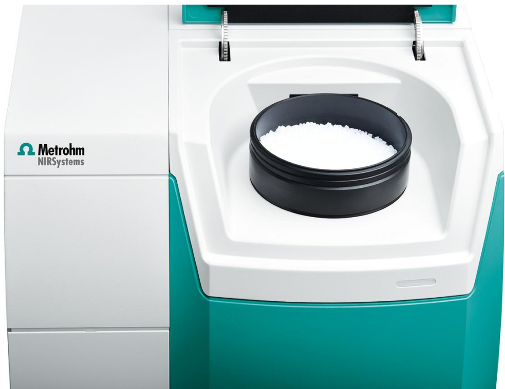
Figure 1. Metrohm DS2500 Solid Analyzer with the DS2500 large sample cup for measuring the intrinsic viscosity of recycled polyethylene terephthalate (rPET).

the large sample cup reduces the influence of the particle size distribution of the polymer pellets ( Figure 1 ). Data acquisition and prediction model development was performed with the software package Vision Air Complete.