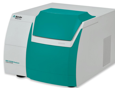
Figure 1. The DS2500 Solid Analyzer was used to collect the spectra of fertilizer samples.

Different fertilizer product types with varying moisture content from 0.12% to 3.82% were measured using a Metrohm DS2500 Solid Analyzer. To overcome sample inhomogeneity, the measurement was performed with a large sample cup in rotation. Data collection and model development was carried out with the Vision Air complete package. Reference values were obtained by coulometric KF-titration coupled with KF oven. The NIRS prediction model was created with the settings described in the following table and validated using a cross validation algorithm.