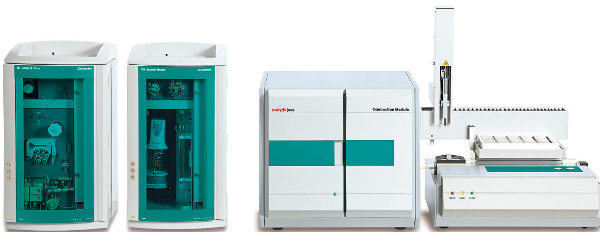
Figure 1. Combustion IC setup consisting of a 930 Compact IC flex (2.930.2560), a 920 Absorber Module (2.920.0010), a Combustion Module (Oven + ABD, 2.136.0700), and an MMS 5000 Autosampler (2.136.0800) configured for solid samples (6.7302.000).

The separation of fluoride (retention time 6.2 minutes) from other halogens is achieved on a Metrosep A Supp 5 - 250/4.0 separation column in combination with the A Supp 5 Guard/4.0 ( Figure 2 ). Automated eluent production with the 941 Eluent Production Module enables continuous and almost unattended operation of the CIC, increasing the overall performance and analysis efficiency. The calibration (0.01–0.5 mg/L) was performed automatically from one standard solution (sodium