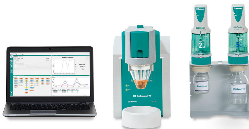
Figure 2. 884 Professional VA, semiautomated for VA analysis