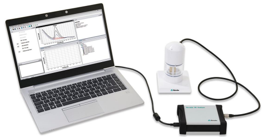
Figure 1. 946 Portable VA Analyzer (SPE)

Prior to the first determination, the ex-situ mercury film is deposited in a separate step on the screenprinted electrode. The water sample and the supporting electrolyte are pipetted into the measuring vessel. The simultaneous determination of cadmium and lead is carried out with the 884 Professional VA or with the 946 Portable VA Analyzer using the parameters specified in Table 1 . The concentration of both elements is determined by two additions of a cadmium and lead standard addition solution.