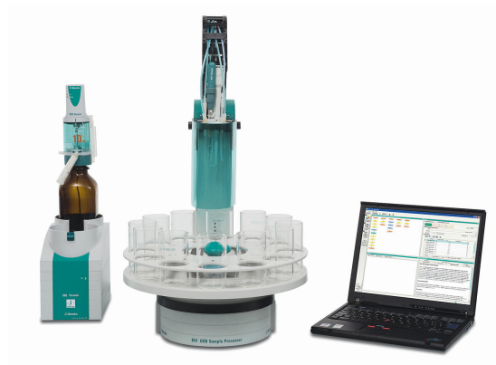
Figure 1. Titration system consisting of an 814 USB Sample Changer in combination with a 907 Titrand and tiamo.

The blank is determined in the same way, but by omitting the sample.