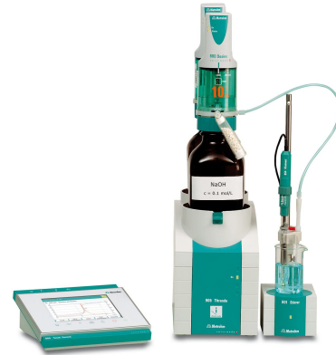
Figure 1. 905 Titrand equipped with a Solvotrode easyClean for the analysis the epoxide equivalents controlled by a 900 Touch Control.

This non-aqueous titration is performed on a 905 Titrand system equipped with a magnetic stirrer and a Solvotrode easyClean for indication. The sample is weighed into a titration beaker, and then dissolved in either chloroform or methylene chloride. Afterwards, TEABr reaction solution and glacial acetic acid are added, and the sample is titrated with standardized perchloric acid until after the equivalence point is reached.