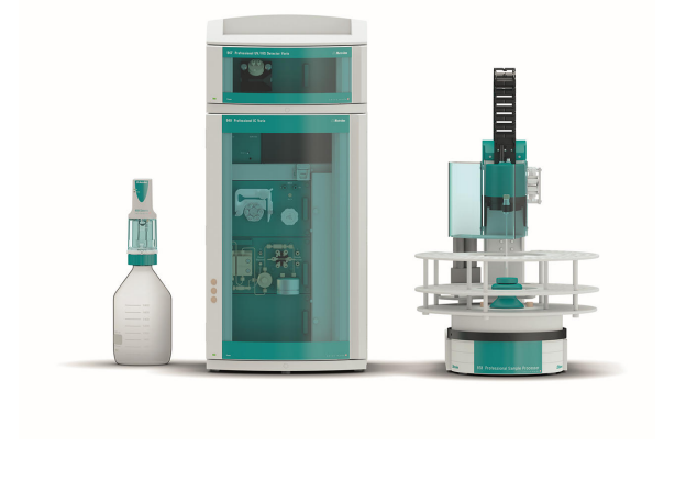
Figure 1. Instrumental setup including a 940 Professional IC Vario (center), 947 Professional UV/VIS Detector Vario SW (top center), 858 Professional Sample Processor (right), and MiPCT-ME, performed with the Metrosep A PCC 2 HC/4.0 and a Dosino (left).

The prepared sample solution was filtered through a 0.2 µm syringe filter and kept in a sample processor under closed conditions prior to analysis. A single-point calibration was used with 4 µg/L NO 2 - prepared from a 1000 mg/L NIST certified standard (Sigma TraceCERT No. 67276).