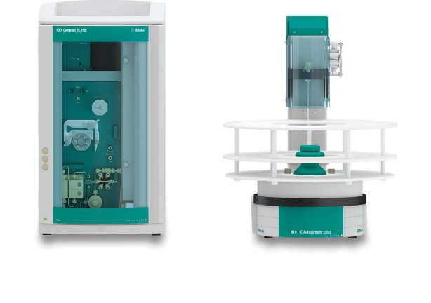
Figure 1. Instrumental setup including a 930 Compact IC Flex with IC Conductivity Detector and a 919 IC Autosampler plus.

The samples were injected directly into the ion chromatograph (Figure 1) without further sample preparation and analyzed using the method parameters given in the USP monograph (Table 1). Anionic components were separated isocratically on a Metrosep A Supp 1 - 250/4.0 column containing the alternative packing material L46. The conductivity signal was detected after sequential suppression.