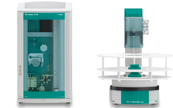
Figure 1. Instrumental setup including a 930 Compact IC Flex with IC Conductivity Detector and a 919 IC Autosampler plus.

The samples were injected directly into the ion chromatograph (Figure 1) without further sample preparation and analyzed using the method parameters given in the USP monograph (Table 1). Anionic components were separated isocratically on a Metrosep A Supp 1 - 250/4.0 column containing the alternative packing material L46. The conductivity signal was detected after sequential suppression.