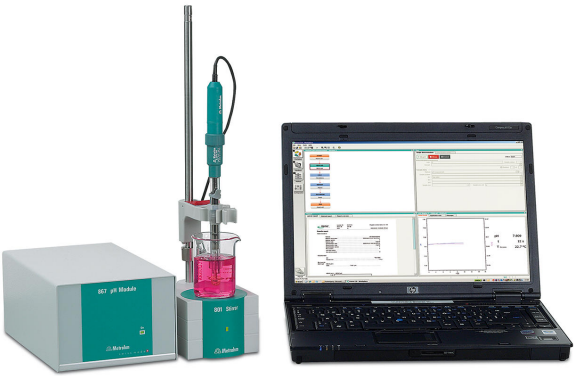
Figure 1. 867 pH Module controlled by tiamo software for performing standard addition.

The filtered sample solution is pipetted into a beaker and filled up to 50 mL with deionized water. Highly concentrated sodium hydroxide (NaOH) solution is added, and the standard addition is performed.