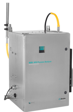
Figure 2. NIRS XDS Process Analyzer from Metrohm Process Analytics.

Wavelength range used: 1100–1650 nm. Inline analysis is possible using a micro interactance reflectance probe with purge on collection tip directly in the fluid bed dryer.