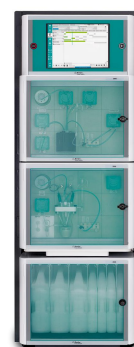
Figure 2. 2060 Process Analyzer.

In order to extract the proper compounds, keep the pH within specifications, and brew the same flavors over multiple batches, both alkalinity and hardness of the process and make-up water must be monitored and kept at proper levels. The Metrohm Process Analytics 2060 and 2035 Process Analyzers ( Figures 2 and 3 ) are ideally suited for the fully automatic execution of these important analyses, as well as additional parameters like pH or conductivity. The process analyzer can send an alarm to the plant control system if alkalinity or hardness levels are not optimal, signaling the distribution control to correct the water chemistry, ensuring consistent product quality.