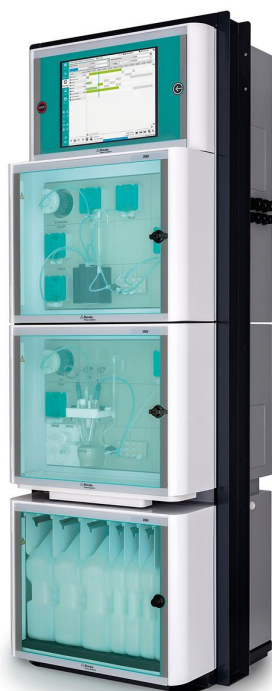
Figure 2. 2060 TI Process Analyzer from Metrohm Process Analytics.

hydrosulfite, but also pH and conductivity measurements to give an overall health status of the dye baths without delay.