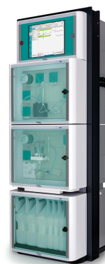
Figure 2. 2060 Process Analyzer for photometric measurements of ultratrace iron and copper in the water-steam circuit of power plants.

The metal transportation in power plant water circuits is currently monitored by CPS racks which collect particulate metals on filter pads over a period of one day to a week. The pads are later digested, and the metals analyzed by ICP-OES or ICP-MS. Total analysis time can take from one to three weeks. Monitoring only the accumulated corrosion products causes a loss of transportation peaks, and detailed information on why the metal loss occurred is lost. A maximum of 2 µg/L Fe is recommended by the Electric Power Research Institute (EPRI) in order to avoid FAC-related issues in the water-steam circuit, and these levels are not accurately measured with the current CPS racks, as seen in long-term comparisons. The continuous online ultratrace analysis of Fe and Cu in the water-steam circuit of power plants is possible using the 2060 Process Analyzer (Figure 2) from Metrohm Process Analytics. This automated process analysis system enables early detection of corrosion processes and peaks, and also monitors the formation and destruction of the protective oxide layer (Figure 3). Continuous analyses also signal a problem before dissolved metals can reach the condensate stream and thus the turbine blades where they would cause damage. In combination with the power plant's Distributed Control System (DCS), online monitoring of Fe and Cu ensures that corrosion can be controlled before it affects the power plant efficiency, ultimately decreasing downtime and lowering maintenance costs.