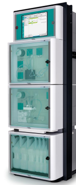
Figure 2. 2060 Process Analyzer for photometric measurements of ultratrace iron and copper in the water-steam circuit of power plants.

The metal transportation in power plant water circuits is currently monitored by CPS racks which collect particulate metals on filter pads over a period of one day to a week. The pads are later digested, and the metals analyzed by ICP-OES or ICP-MS. Total analysis time can take from one to three weeks. Monitoring only the accumulated corrosion products causes a loss of transportation peaks, and detailed information on why the metal loss occurred is lost. A maximum of 2 µg/L Fe is recommended by the Electric Power Research Institute (EPRI) in order to avoid FAC-related issues in the water-steam circuit, and these levels are not accurately measured with the current CPS racks, as seen in long-term comparisons. The continuous online ultratrace analysis of Fe and Cu in the water-steam circuit of power plants is possible using the 2060 Process Analyzer (Figure 2) from Metrohm Process Analytics. This automated process analysis system enables early detection of corrosion processes and peaks, and also monitors the formation and destruction of the protective oxide layer (Figure 3). Continuous analyses also signal a problem before dissolved metals can reach the condensate stream and thus the turbine blades where they would cause damage. In combination with the power plant's Distributed Control System (DCS), online monitoring of Fe and Cu ensures that corrosion can be controlled before it affects the power plant efficiency, ultimately decreasing downtime and lowering maintenance costs.