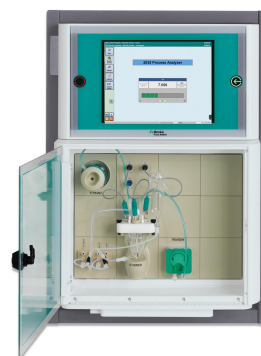
Figure 3. 2035 Process Analyzer - Potentiometric for accurate determination of TMAH in developer.

The 2035 Process Analyzer configured for potentiometric titration performs the accurate analysis of TMAH online using a combined pH electrode. Precise dosing of TMAH in the developer solution by the analyzer is also a possibility to ensure a stable concentration for every batch.