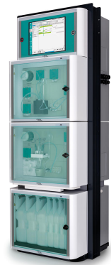
Figure 3. The 2060 TI Process Analyzer from Metrohm Process Analytics can monitor several critical parameters online in the anodizing process.

The elimination of manual sampling combined with the continuous monitoring offered by online analyzers significantly reduces the risk of bath chemistry fluctuations, ultimately leading to fewer defects and the need for rework. By providing a constant flow of accurate data, online process analyzers empower manufacturers to achieve consistent, high-quality anodizing results.