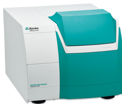
Figure 1. DS2500 Solid Analyzer

33 PVC samples with varying molecular weights from 113000–192000 g/mol were measured on the DS2500 Solid Analyzer. The Metrohm software package Vision Air Complete was used for all data acquisition and prediction model development.