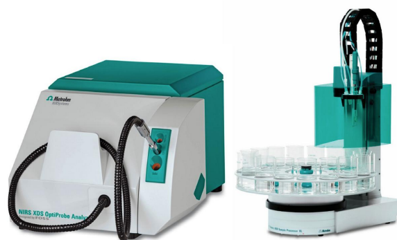
Figure 1. The NIRS XDS OptiProbe Analyzer and the 815 Robotic Sample Processor.

17 spectra of samples with varying moisture content were collected using a Metrohm NIRS XDS OptiProbe Analyzer in combination with the 815 Robotic Sample Processor. With the attached large sample rack, it was possible to automate measurements of up to 62 samples in series. The reference values were obtained by KF-titration. The data set consisting of spectra and lab values was split into a calibration set (11 samples) and validation set (6 samples). Outlier detection was performed on pre-treated spectra (2 nd derivative) using a maximum distance in wavelength space algorithm.