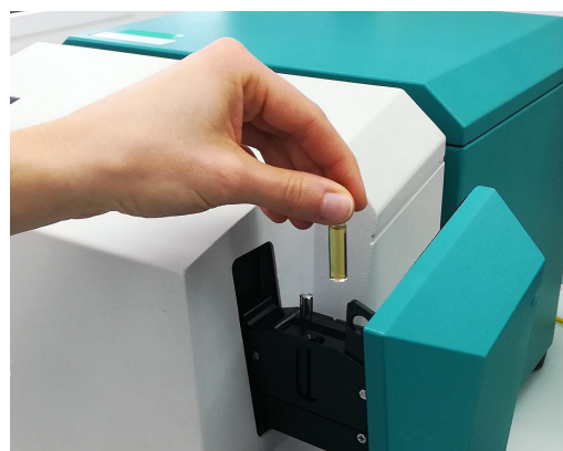
Figure 1. XDS RapidLiquid Analyzer and an isocyanate sample present in the 8 mm Disposable Vial.

Isocyanate samples were measured with a XDS RapidLiquid Analyzer in transmission mode over the full wavelength range (400–2500 nm). Reproducible spectrum acquisition was achieved using the built-in temperature control (at 30 °C) of the XDS RapidLiquid Analyzer. For convenience, disposable vials with a path length of 8 mm were used, which made cleaning of the sample vessels unnecessary. The Metrohm software package Vision Air Complete was used for all data acquisition and prediction model development.