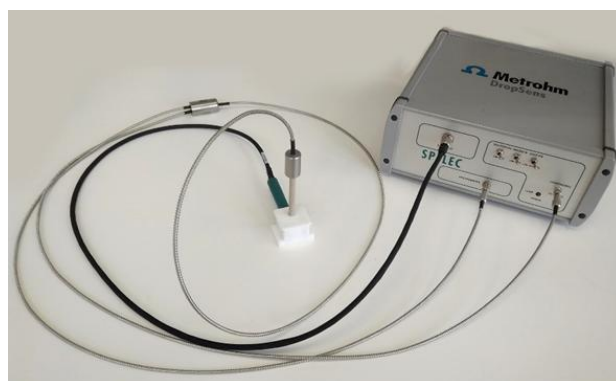
Figure 1. Setup for UV/VIS spectroelectrochemistry.

recorded along with the electrochemical signal, obtaining additional information of the electrode surface during the whole experiment.