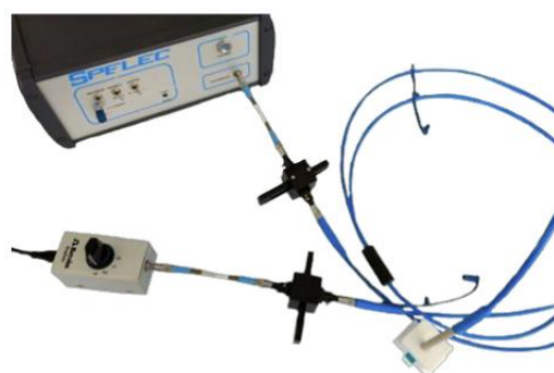
Figure 1. The SPELEC setup used for the fluorescence spectroelectrochemistry measurements

For the electrochemical reactions, Screen-Printed Carbon Electrodes (ref. 110) were employed.