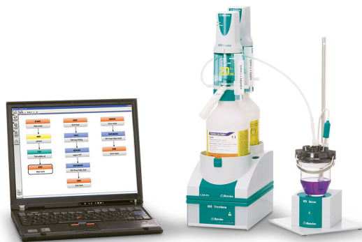
Figure 1. 859 Titrotherm equipped with a Thermoprobe and tiamo. Example setup for the analysis of aluminum.

The thermometric titration is carried out automatically with the tiamo TM software in combination with an 859 Titrotherm and a Thermoprobe.