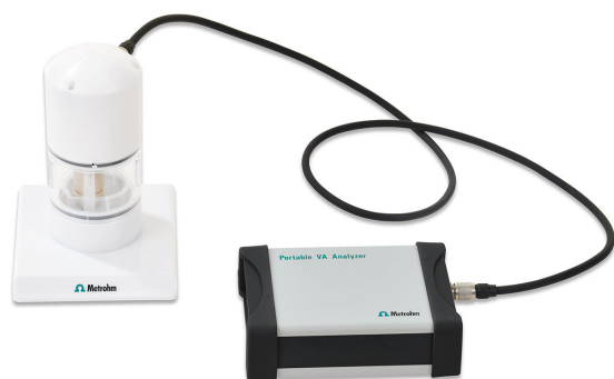
Portable VA Analyzer (SPE) Portable metal analyzer for the determination of heavy metals. Device version for screen-printed electrodes (SPE). The system is comprised of potentiostat and separate measuring stand with integrated stirrer and replaceable electrode. The instrument is operated with the Portable VA Analyzer software. The power is supplied via the USB connector and via the integrated rechargeable battery. The device is supplied with all required accessories in a carrying case. Screen-printed electrodes are not included in the scope of delivery.