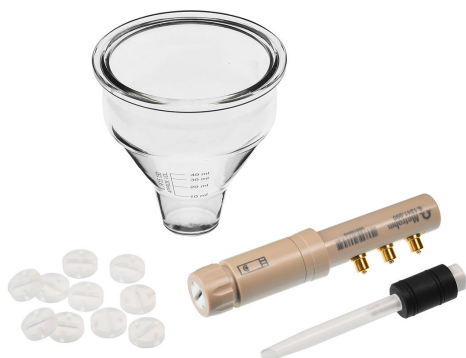
VA accessory equipment with SPE electrode shaft for professional VA instruments Accessory equipment for use with screen-printed electrodes (SPE). Contains electrode shaft for screen-printed electrodes, stirrer, and measuring vessel. Without electrodes.