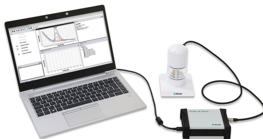
Figure 1. 946 Portable VA Analyzer (SPE)

Prior to the first determination, the ex-situ mercury film is deposited in a separate step on the screenprinted electrode. The water sample and the supporting electrolyte are pipetted into the measuring vessel. The simultaneous determination of cadmium and lead is carried out with the 884 Professional VA or with the 946 Portable VA Analyzer using the parameters specified in Table 1 . The concentration of both elements is determined by two additions of a cadmium and lead standard addition solution.