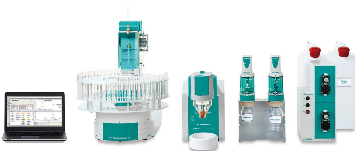
Figure 2. 884 Professional VA, fully automated for VA analysis