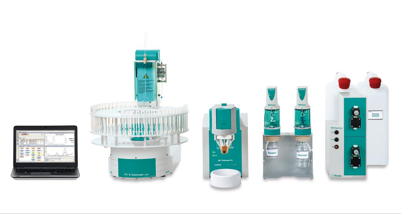
Figure 1. 884 Professional VA, fully automated for VA analysis

pipetted into the measuring vessel. The determination of chromium(VI) is carried out with the 884 Professional VA using the parameters specified in Table 1 . The concentration is determined by two additions of a chromium(VI) standard addition solution.