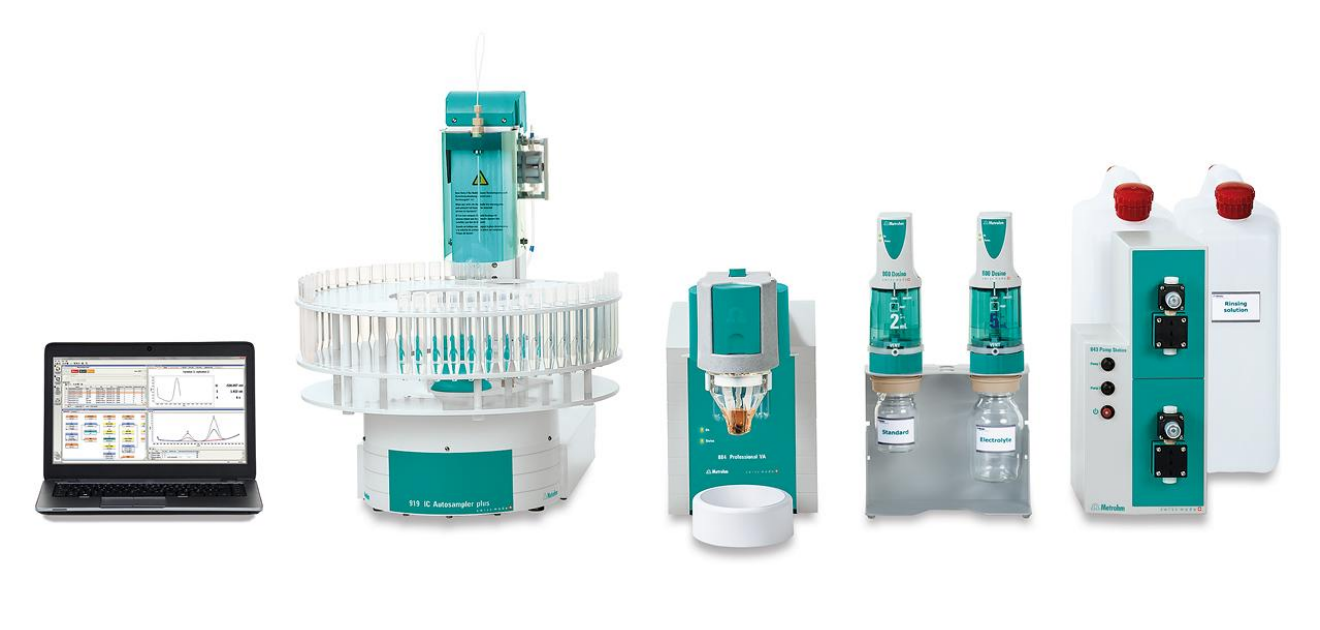
Figure 1. 884 Professional VA fully automated for VA analysis

using the parameters specified in Table 1 . The concentration is determined by two additions of a nickel and cobalt standard addition solution. The Bi drop electrode is electrochemically activated prior to the first determination.