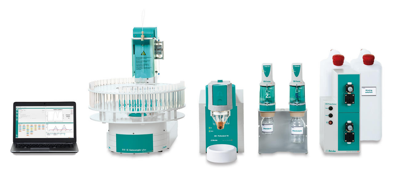
Figure 1. 884 Professional VA fully automated for VA analysis

using the parameters specified in Table 1 . The concentration is determined by two additions of a nickel and cobalt standard addition solution. The Bi drop electrode is electrochemically activated prior to the first determination.