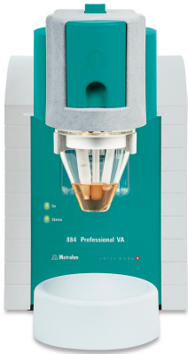
Figure 1. 884 Professional VA manual for MME.

Add 10 mL oxidized sodium chloride brine sample and 2 mL of ultrapure water into the measuring vessel. The determination of iodide is carried out with the 884 Professional VA (Figure 1) using the parameters specified in Table 1. The concentration is determined by two additions of iodate standard addition solution.