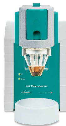
Figure 1. 884 Professional VA manual for MME.

Add 10 mL acetic acid sample and then 2 mL ultrapure water into the measuring vessel. Carry out the determination of iodide using the 884 Professional VA (Figure 1) and the parameters specified in Table 1. The concentration is determined by two additions of iodide standard addition solution.