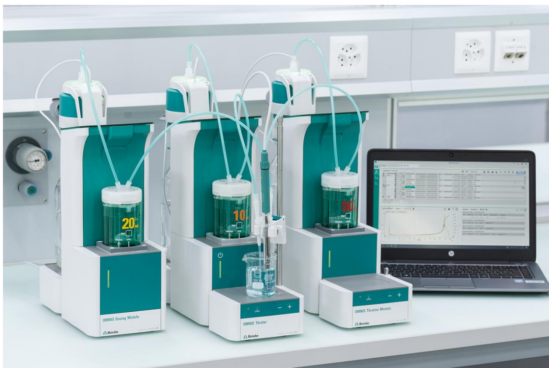
Figure 2. OMNIS Titrator equipped with a dSolvotrode electrode for the determination of caffeine content in nonaqueous samples.