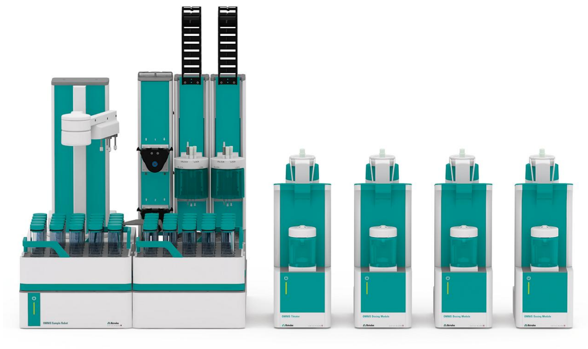
Figure 1. OMNIS Robot S with Discover and parallel analysis.

OMNIS automates the entire analysis process with: