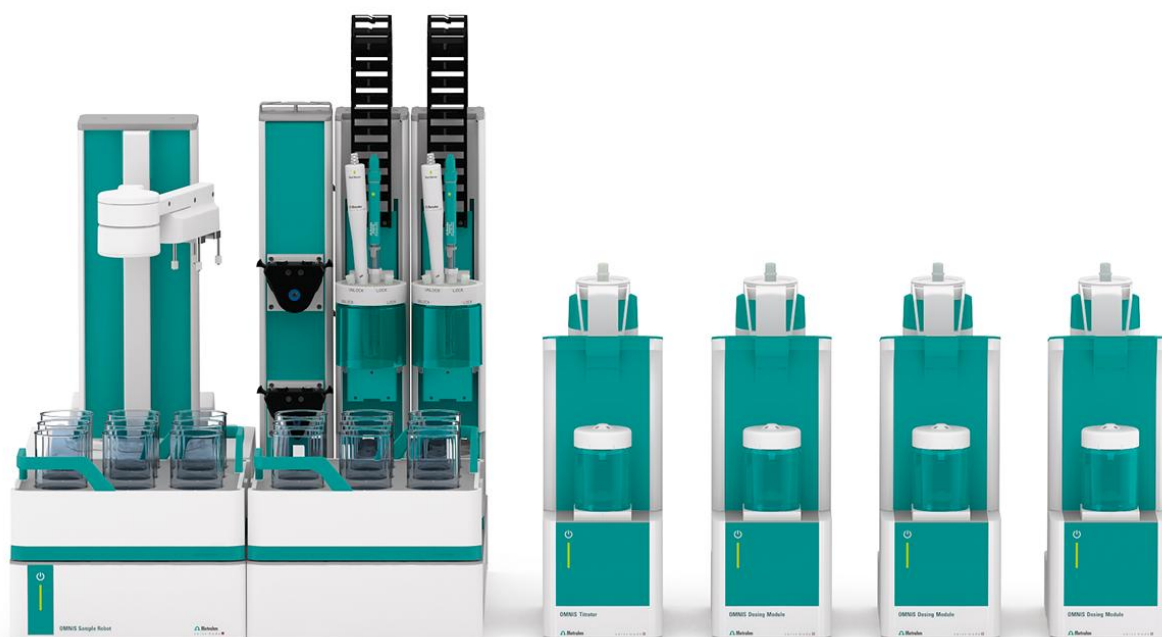
Figure 1. OMNIS Sample Robot S with an OMNIS Titrator and three Dosing Modules. Not pictured: additional OMNIS Sample Robot with Titrator and Dosing Modules as well as required Dosing Interface and Dosinos.