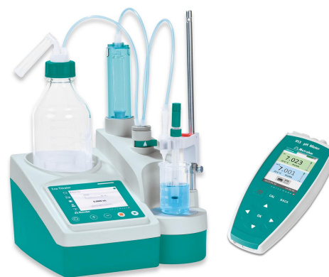
Figure 1. Eco Titrator and a 913 pH Meter with a maintenance-free Ecotrode Gel with NTC.

For the TTA measurement, the solution is titrated until after the first equivalence point with standardized sodium hydroxide solution is reached.