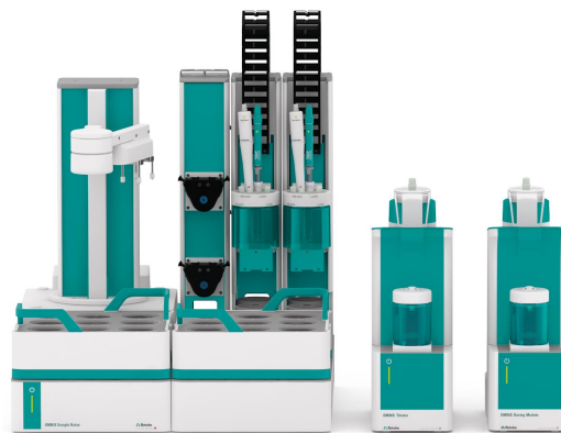
Figure 1. OMNIS Sample Robot, OMNIS Dosing module, and OMNIS Advanced Titrator equipped with fluoride ion selective electrode for the assay of lithium nitrate.

After weighing the sample into the sample beaker, all further steps are automatically carried out by the system. The assay is performed by a precipitation titration with ammonium fluoride in an ethanolic solution.