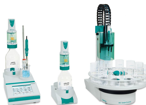
Figure 1. 916 Ti-Touch and 810 Sample Processor. Example setup for the determination of the permanganate index in water.

To stabilize the sample, sulfuric acid is added directly after sampling.