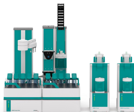
Figure 1. OMNIS system consisting of an OMNIS Sample Robot, an OMNIS Advanced Titrator, and an OMNIS Dosing Module.

For samples that are not completely miscible in water (e.g., MIBK or 2-ethoxyethyl acetate), the same procedure is used as for water-soluble samples with the exception that carbon-dioxide free ethanol is used instead of deionized water.