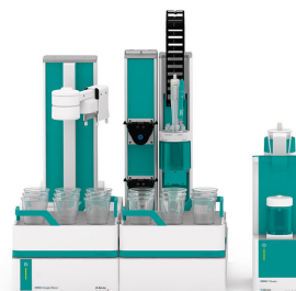
Figure 1. OMNIS system consisting of an OMNIS Sample Robot S and an OMNIS Advanced Titrator equipped with a Profitrode for the determination of the reserve alkalinity in engine coolant.

The obtained results lay within the limits given by ASTM D1121 and are therefore acceptable. An