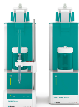
Figure 1. OMNIS system consisting of an OMNIS Advanced Titrator and an OMNIS Dosing Module equipped with a double Pt-wire electrode for indication.

Sample and titration solvent (consisting of toluene, methanol, sulfuric acid, and glacial acetic acid) are pipetted into a thermostated vessel. While stirring, the solution is cooled to between 0–5 °C. After reaching this temperature, the solution is titrated with standardized bromine until after the equivalence point is reached.