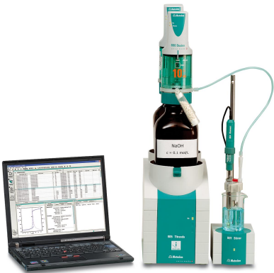
Figure 1. 905 Titrando with tiamo. Example setup for the analysis of lithium in brine.

Calcium will interfere with the analysis and has to be analyzed separately.